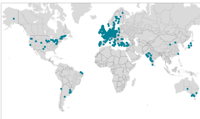
Operating sites (onshore and offshore) of evaluated wind-turbine fleet

Fraunhofer IWES secures investments in technological developments through validation, shortens innovation cycles, accelerates certification procedures, and increases planning accuracy in the wind energy and hydrogen technology sectors. At present, more than 300 scientists and employees together with about 150 students are committed to driving forward the energy transition. Comprehensive experience in converter-reliability research and the operation of large-scale test facilities form the basis of all services offered in the HiPE-LAB.